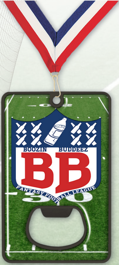
SL-BOM15 EXPRESS BOTTLE OPENER MEDALLION AS LOW AS $4.16 (P)

YOUR FANTASY FOOTBALL PRODUCTS ARE REAL!