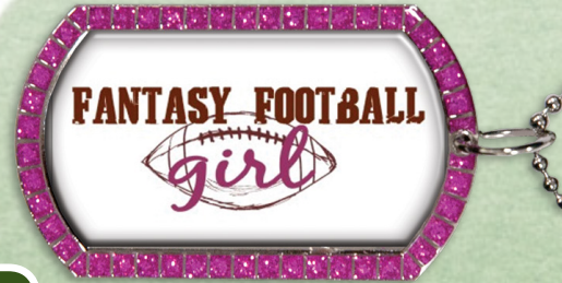
SL-DT5 EXPRESS PINK DOG TAG AS LOW AS $2.92 (P)

PROFESSIONAL SIZE & QUALITY. MADE OF REAL METAL WEIGHS OVER 7 POUNDS!