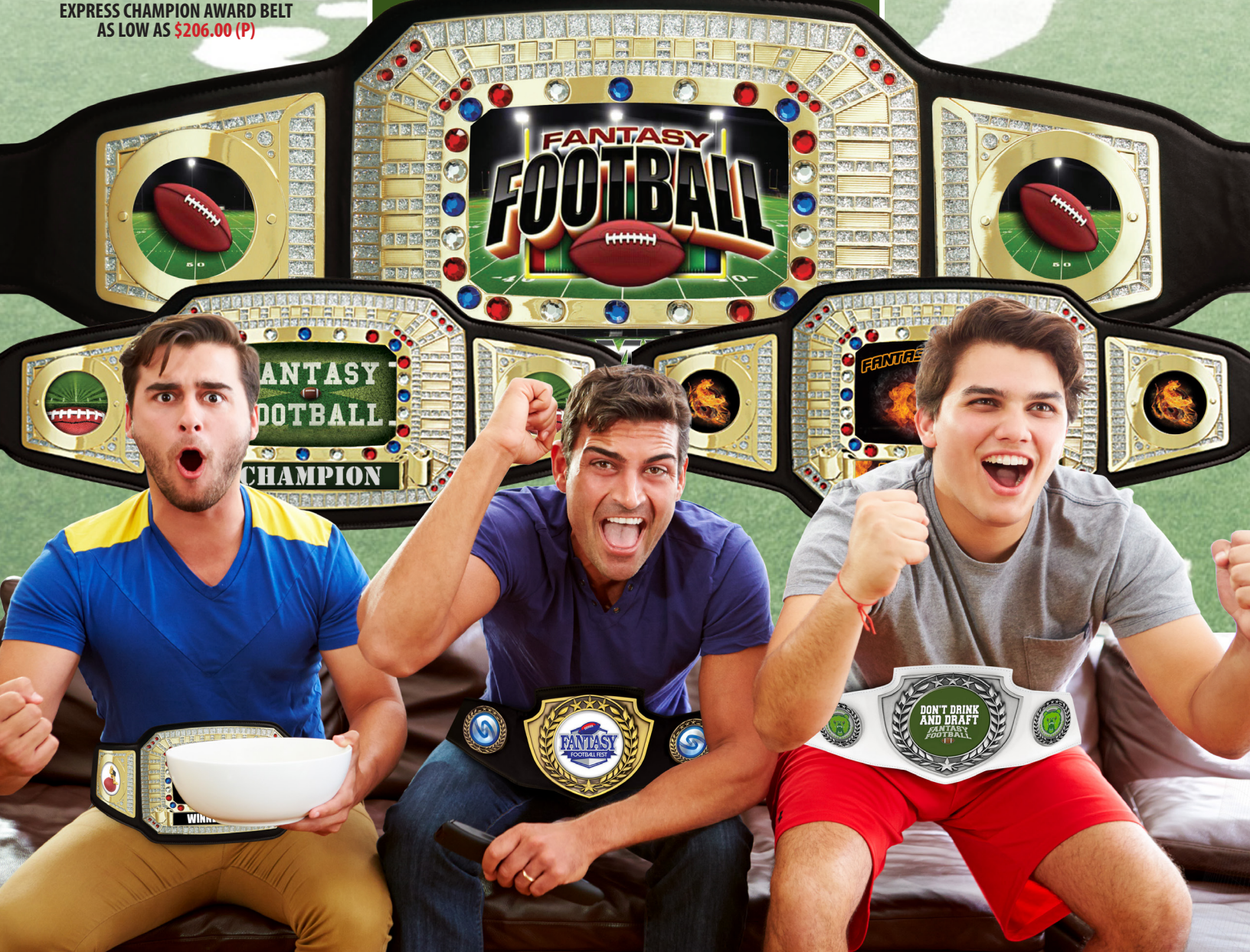
SL-CABL115 EXPRESS CHAMPION AWARD BELT AS LOW AS $206.00 (P)

PROFESSIONAL SIZE & QUALITY. MADE OF REAL METAL WEIGHS OVER 7 POUNDS!