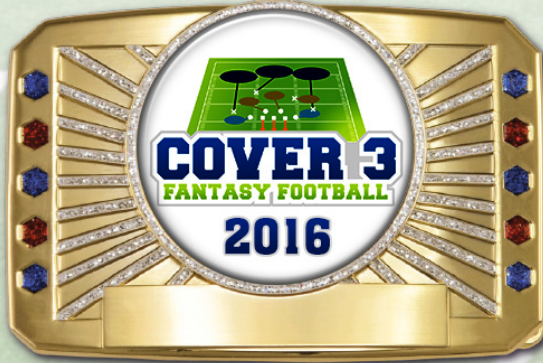
SL-BM14 EXPRESS BELT BUCKLE AS LOW AS $7.16 (P)