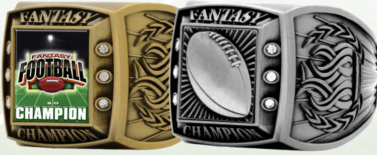
SL-RGB11 CHAMPIONSHIP RING AS LOW AS $9.20 (P)