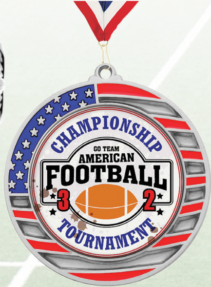
SL-071A EXPRESS AMERICAN FLAG MEDALLION AS LOW AS $2.64 (P)